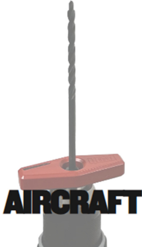
Bullseye14 Aircraft Bit with Device