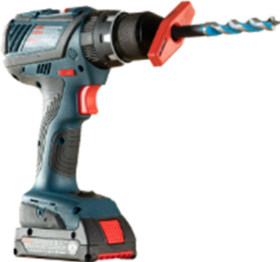
Bullseye8 Grey Drill Red Device