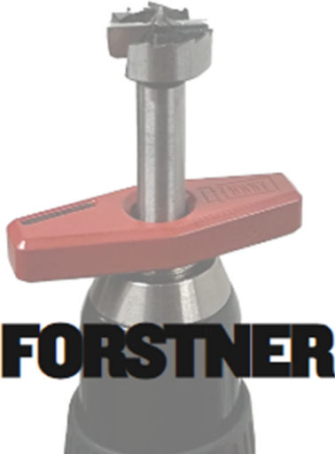
Bullseye10 Frostner bit with device