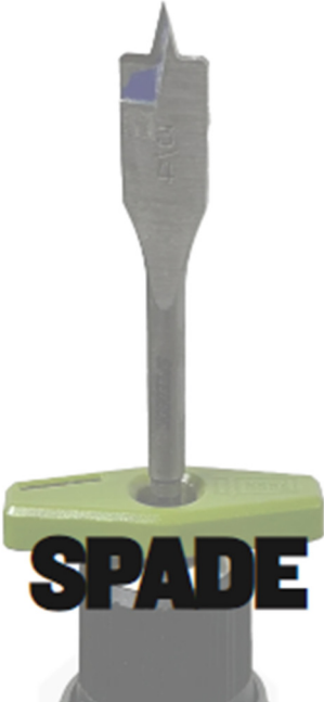
Bullseye13 Spade Bit with device