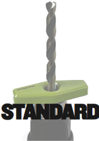
Bullseye11 Standard bit with device