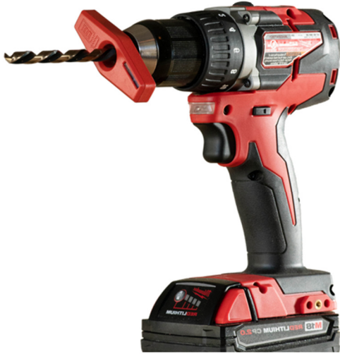
Bullseye16 Red Drill Red Device