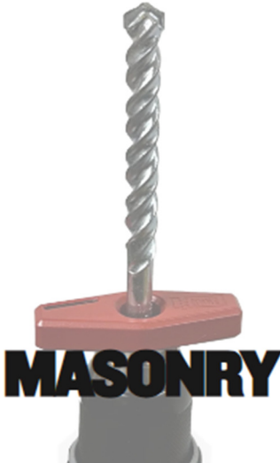
Bullseye9 Masonry bit with device