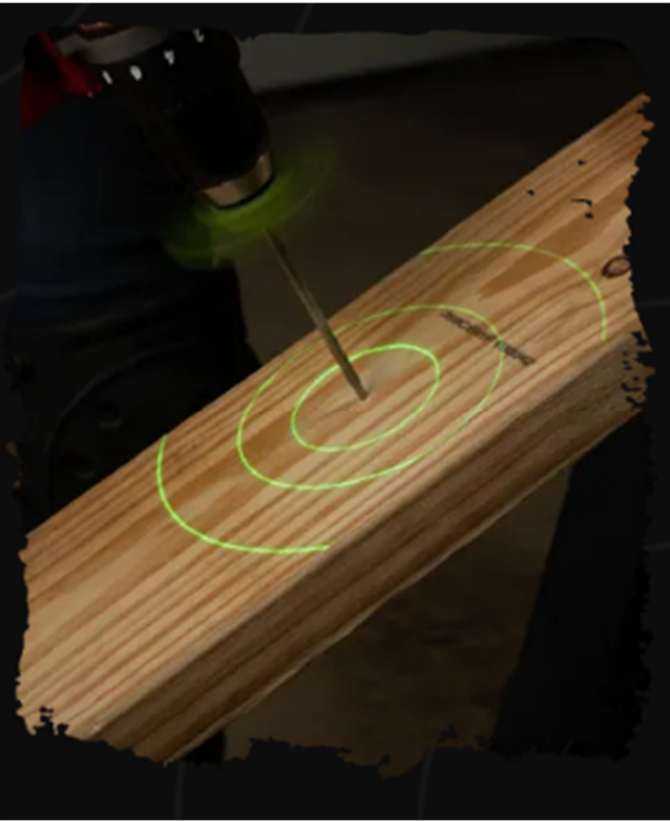
Bullseye3 Angle Board Laser Image