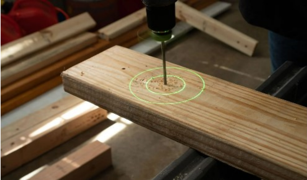
Bullseye1 Horizontal Board Laser Image