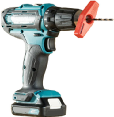
Bullseye7 Cobalt Drill Red Device