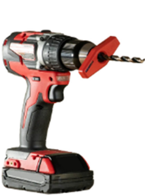
Bullseye4 Red Drill and Red Device