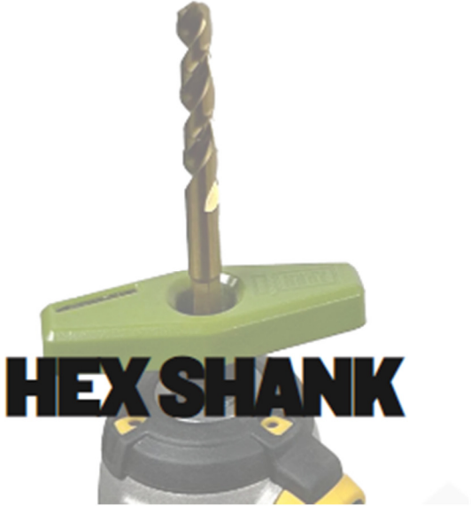
Bullseye15 Hex Shank bit with device