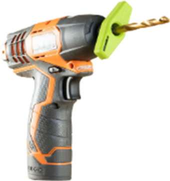
Bullseye6 Orange Drill and Green Device