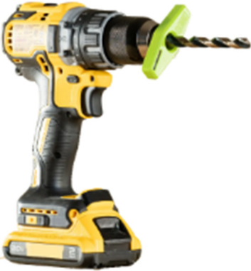
Bullseye5 Yellow Drill and Green Device