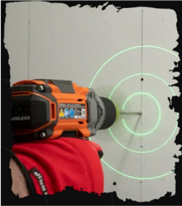
Bullseye2 Orange Drill and Drywall